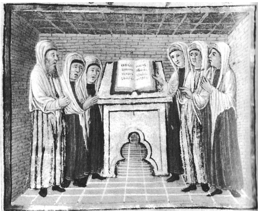
Fig. 22. Oratory of German Jews with the “almemor”, miniature from the Rothschild Miscellany , Venice (?), 1475, Jerusalem, Bezalel Museum.