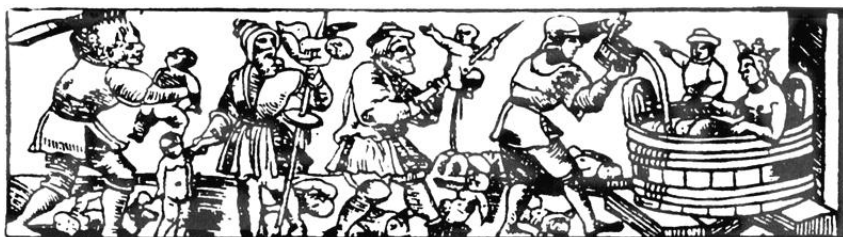
Fig. 1. The Pharaoh's Bath of Blood , woodcut from the Passover Haggadah, Prague, Gershom Cohen, 1526.

פרעס אין יידן קינדער בלוט ער טאט גיבארן : גאט און מולדת בלוט נישט און גרסאכן וואל לאן