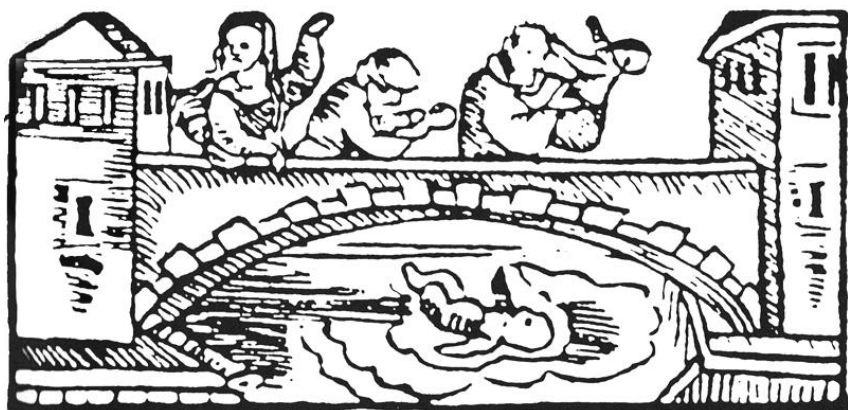
Fig. 8. Children Drowned in the Nile , woodcut from the Passover Haggadah, Prague, Gershom Cohen, 1526.