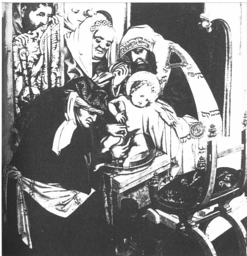
Fig. 19. Circumcision of Christ , altar piece, circa 1450, Nuremberg, Liebfrauenkirche.