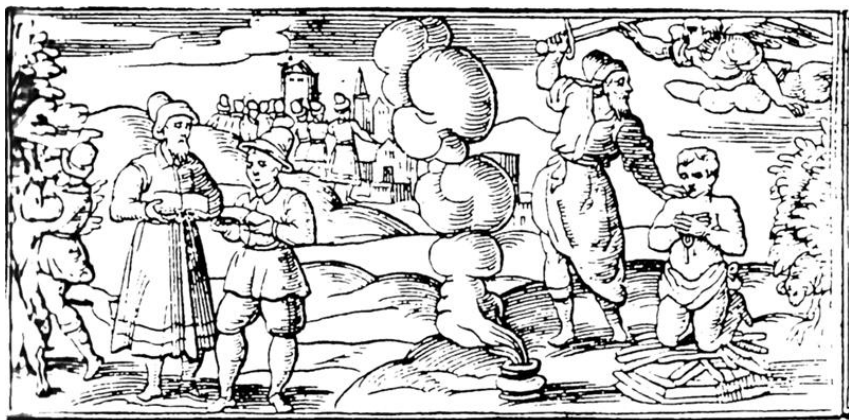
Fig. 12. Sacrifice of Isaac , woodcut from the Passover Haggadah, Venice, Giovanni De Gara, 1609.