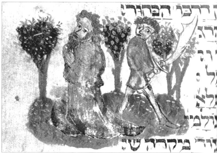
Fig. 13. German Jew Being Executed with a Sword , miniature from Jewish Code 37 from the Hamburg State and University Library (c. 79r).