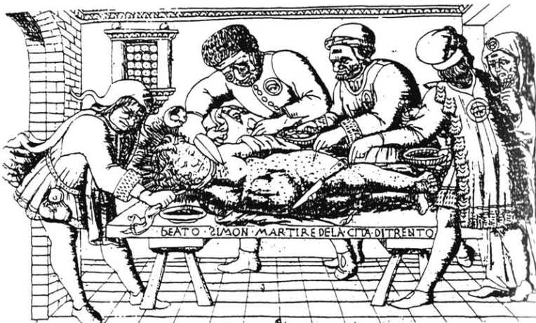
Fig. 16. Martyrdom of Simonino and Jews with Eyeglasses , woodcut, Northern Italy 1475-85 (from A.M. Hind, Early Italian Engraving , II, New York-London, 1938, table 74).