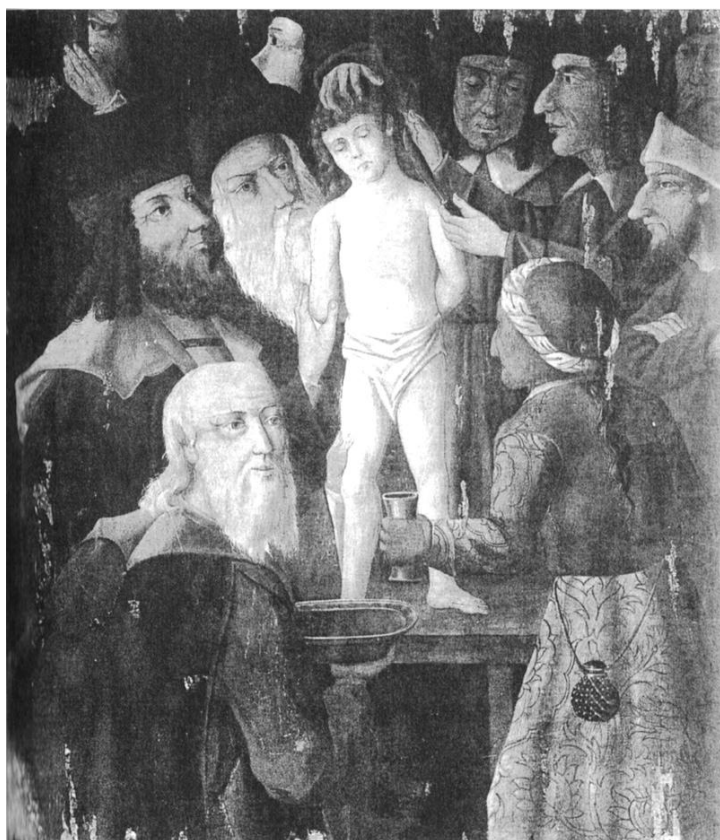
Fig. 21. Alto Adige School, Martyrdom of Simonino , first half of 16th century, Trent, Provincial Museum of Art.