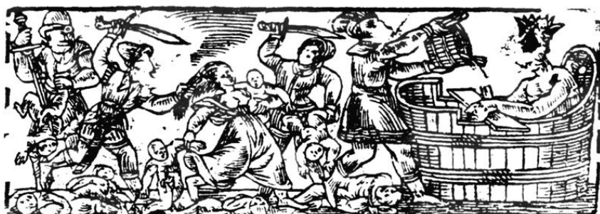
Fig. 2. The Pharaoh's Bath of Blood , woodcut from the Passover Haggadah, without publisher, circa 1580.

פרעס אין יידן קינדער בלוט ער טאט גיבארן : גאט און מולדת בלוט נישט און גרסאכן וואל לאן