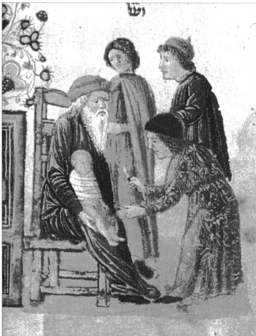
Fig. 17. Circumcision , miniature from the Rothschild Miscellany , Venice (?), 1475, Jerusalem, Bazelel Museum.