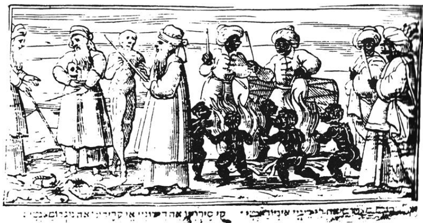
Fig. 7. Enchanters and Necromancers , woodcut from the Passover Haggadah, Venice, Giovanni De Gara, 1609.