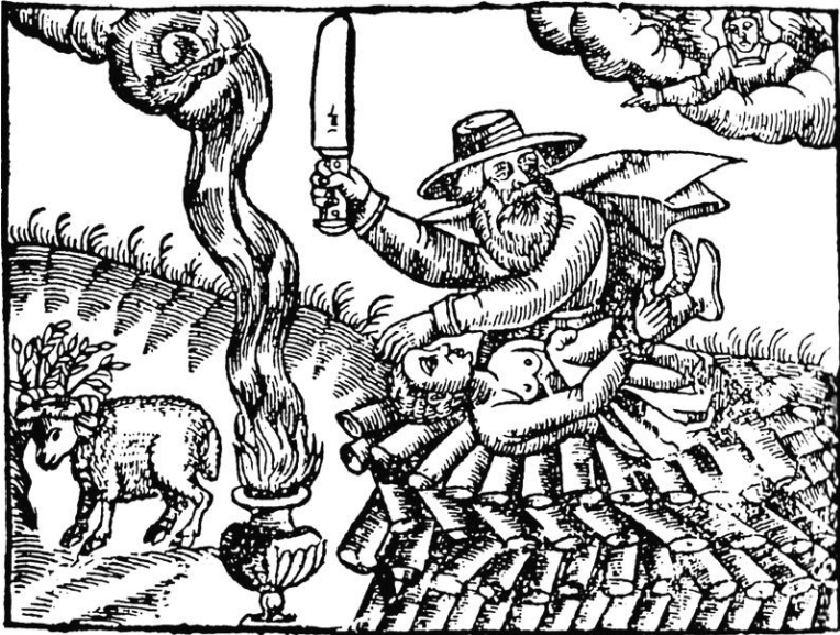
Fig. 15. Sacrifice of Isaac , woodcut from the Ritual Responsals (Sheelot w-teshuvot) of Asher b. Yechiel, Constantinople, without publisher, 1517.