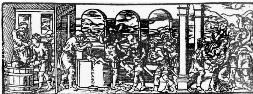
Fig. 4. The Pharaoh's Bath of Blood , woodcut from the Passover Haggadah , Mantua, Giacomo Rufinelli, 1560.