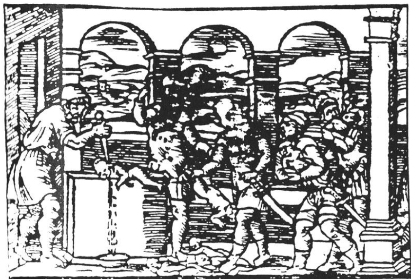
Fig. 5. The Pharaoh's Bath of Blood , woodcut from the Passover Haggadah , Mantua, Giacomo Rufinelli, 1560 (detail).