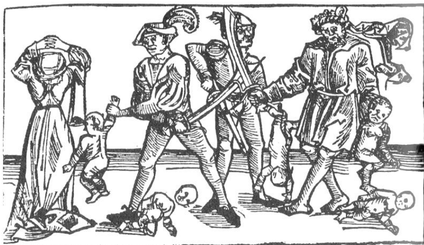
Fig. 3. The Massacre of the Innocents , woodcut from the Ultraquist Passional , Prague, Jan Camp, 1495.