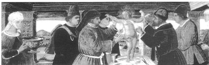
Fig. 20. Gandolfino da Roreto d'Asti, Martyrdom of Simonino , tempera on wood, end of 15th century, Jerusalem, Israel Museum.