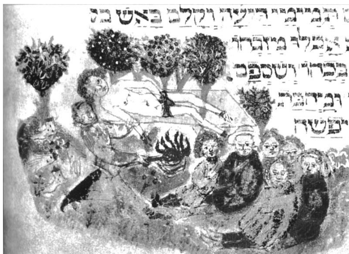
Fig. 14. German Jew Tortured with Fire , miniature from Jewish Code 37 from the Hamburg State and University Library (c. 79r).